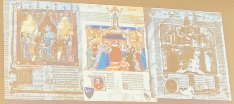
Escorial, Real Biblioteca del Monasterio de San Lorenzo del Escorial, ç-1-1, f. 3r