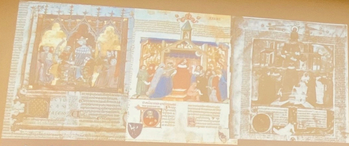
Escorial, Real Biblioteca del Monasterio de San Lorenzo del Escorial, ç-1-1, f. 3r